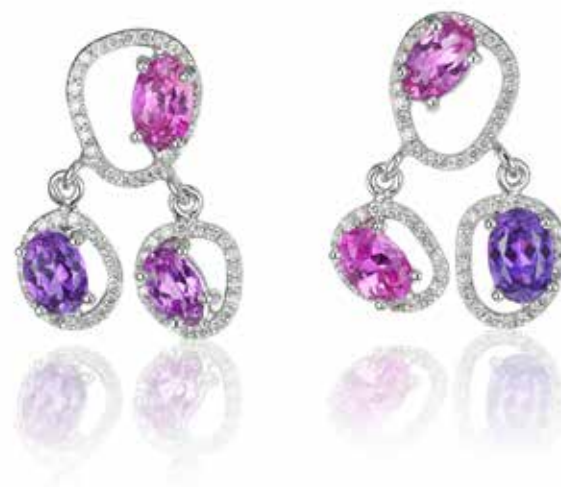
Earrings Lori White gold 10.2 gr