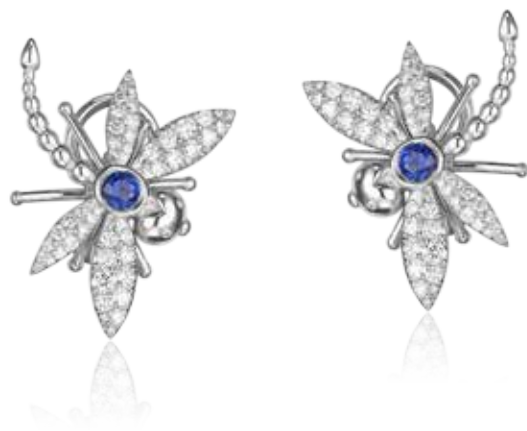
Earrings Nairi White gold 9 gr