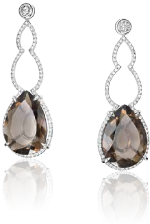
Earrings Lori White gold 8 gr