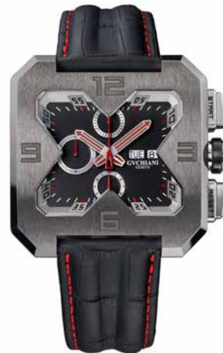
Big Square Grey Titanium Limited Edition