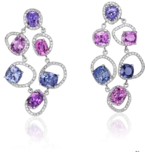
Earrings Lori White gold 24 gr