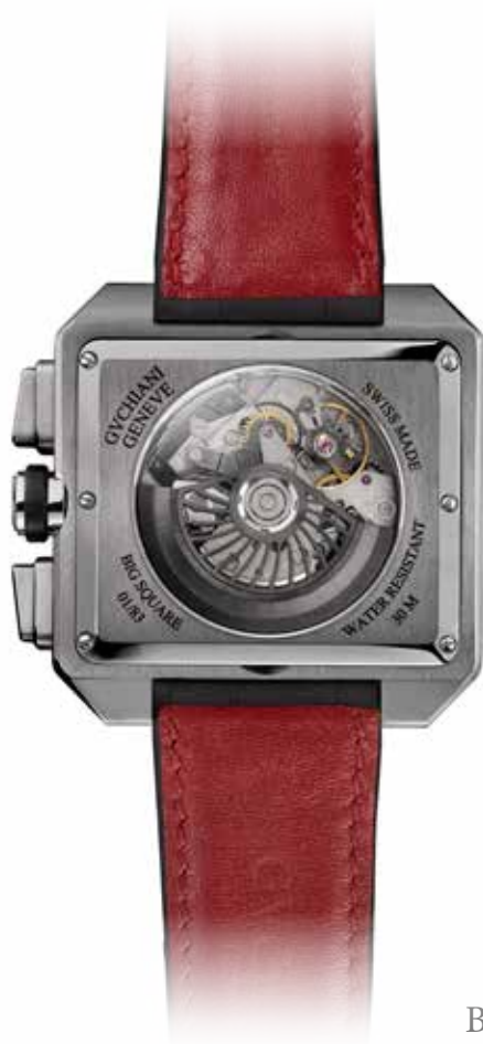
Big Square, back Grey Titanium