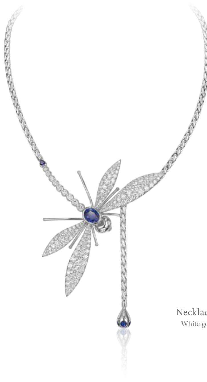
Necklace Nairi White gold 51 gr