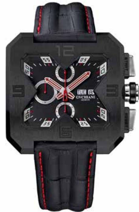
Big Square Black Titanium Limited Edition