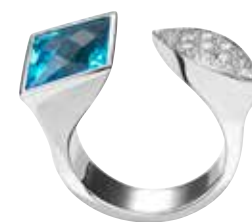
Ring Nairi White gold 9 gr