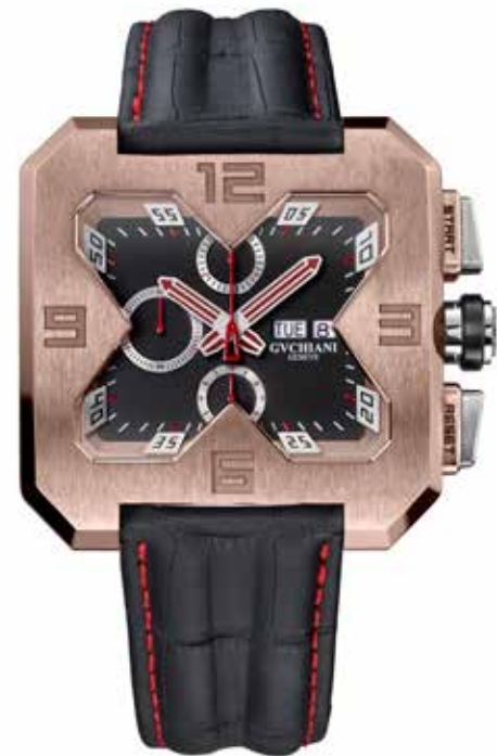
Big Square Pink gold Limited Edition