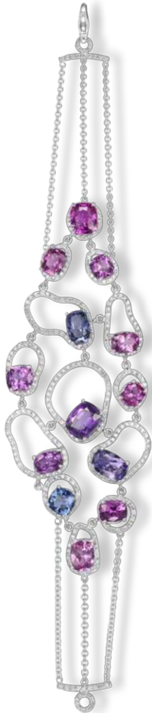
Bracelet Lori White gold 18 gr