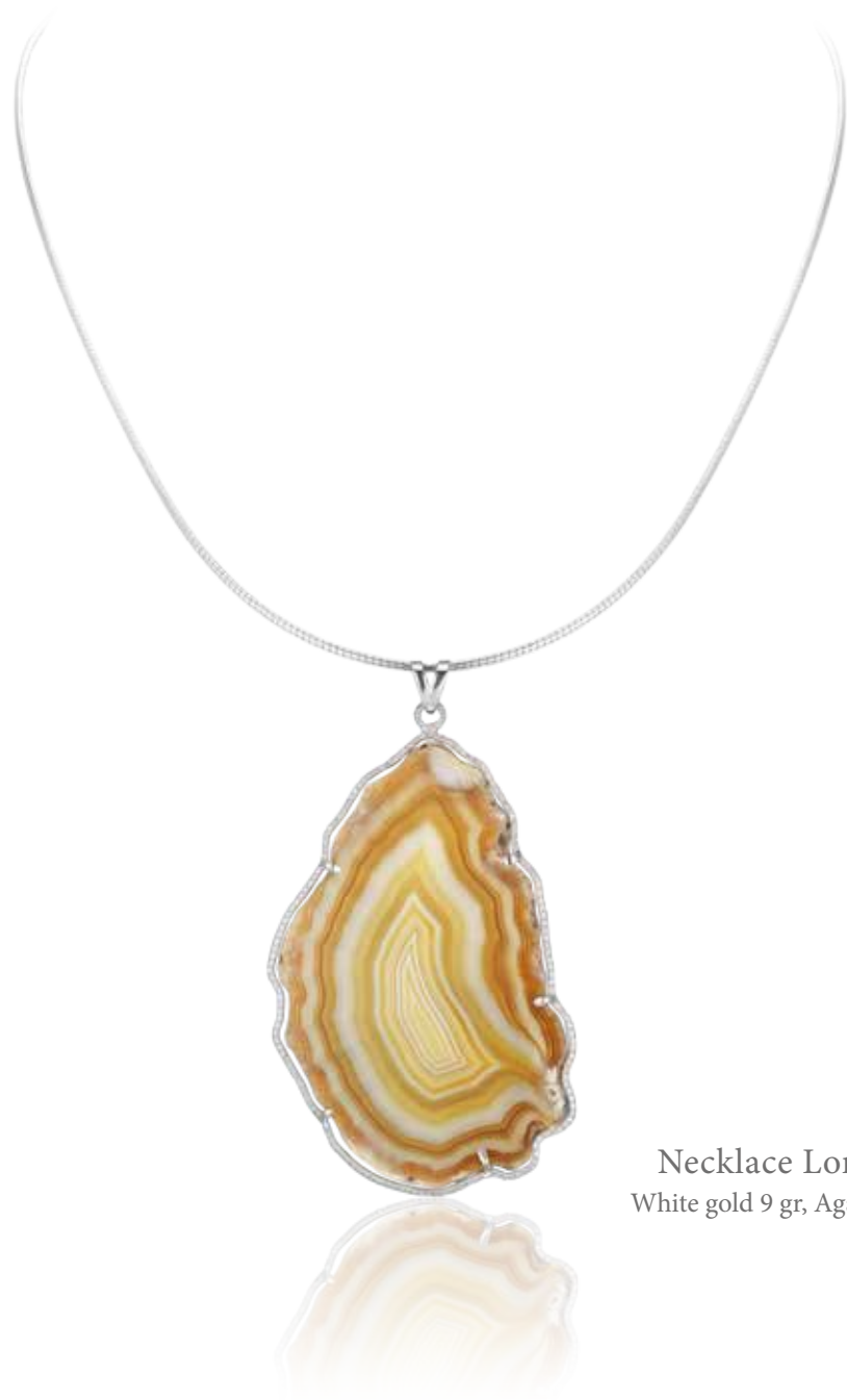
Necklace Lori White gold 9 gr, Agathe