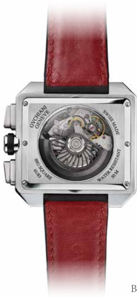
Big Square, back Titanium