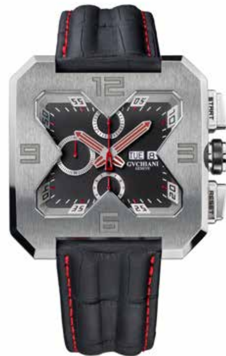
Big Square Titanium Limited Edition