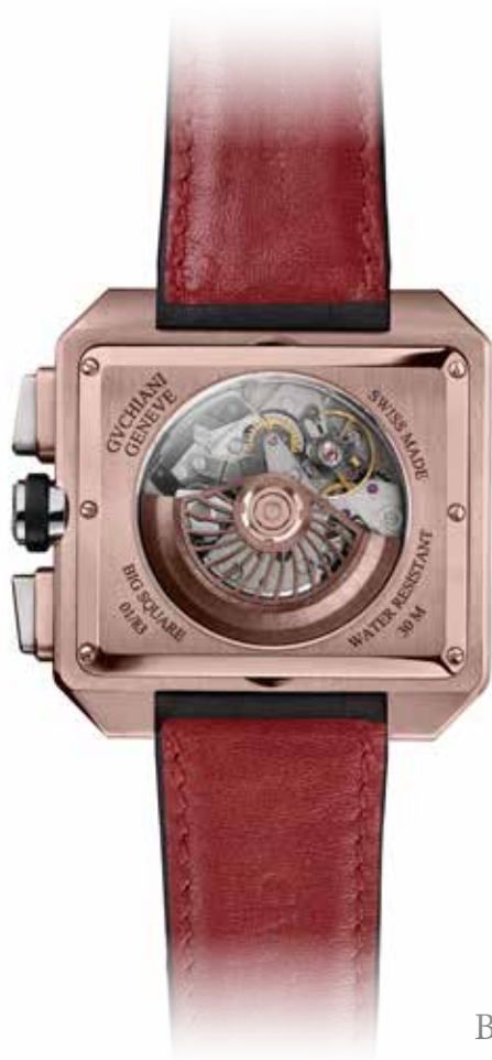
Big Square, back Pink gold