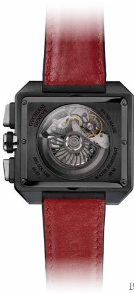
Big Square, back Black Titanium