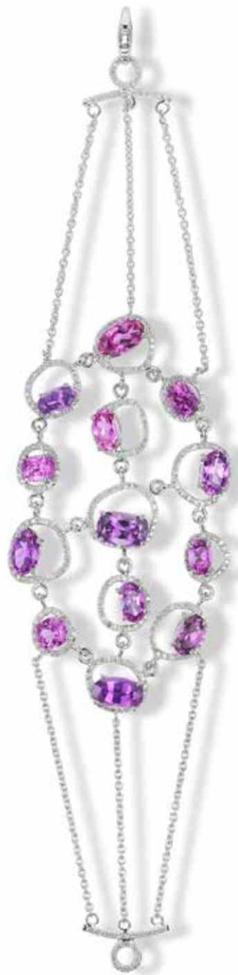
Bracelet Lori White gold 19 gr