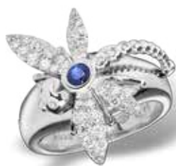
Ring Nairi White gold 13 gr