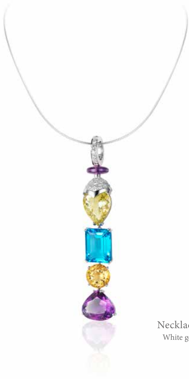
Necklace Nairi White gold 15 gr